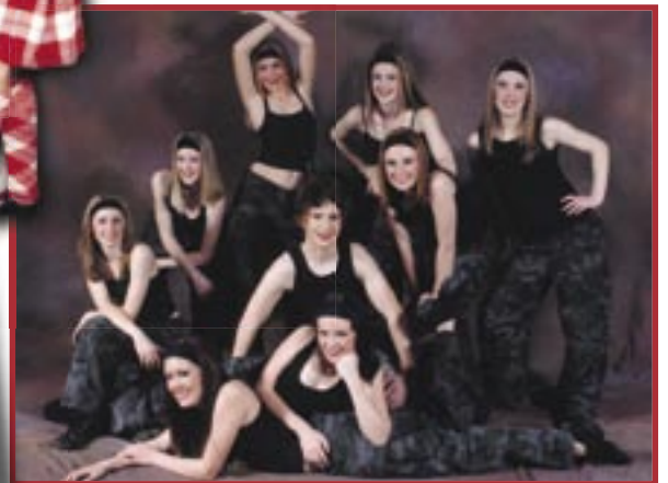
Participating in other dance disciplines...