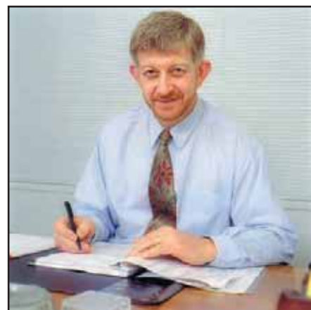
by Joe Debruyne

The scheme is now available for the self-employed who earn less than $58,980 and meet other eligibility criteria.