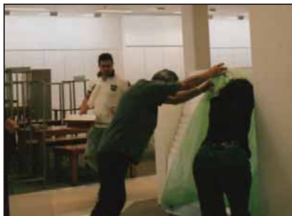
It took muscle power getting ready to reopen

The SDA is working with both members and management to obtain the best possible outcome for everyone under the rostering principles of the new Agreement. ▼